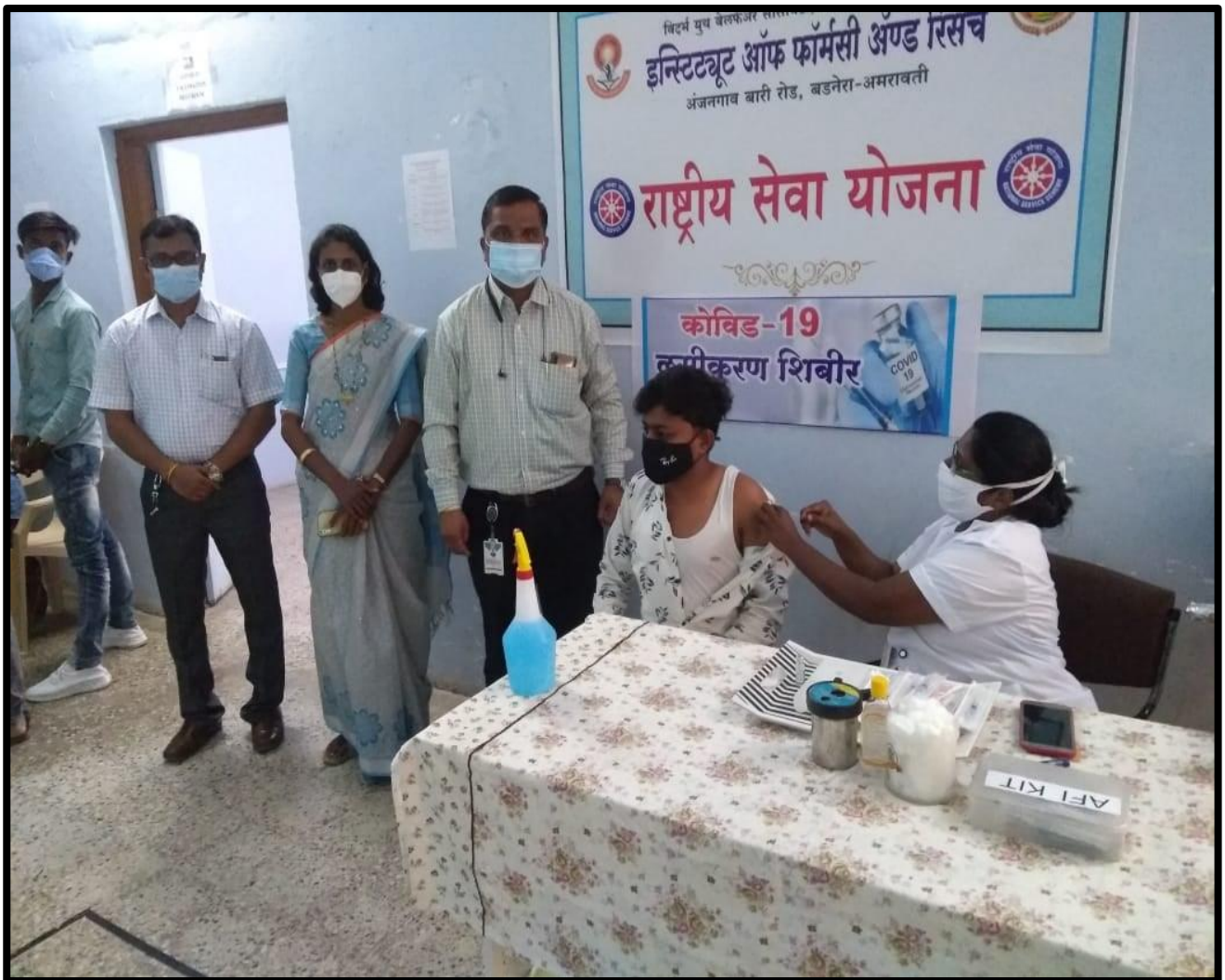
Covid 19 Vaccination Drive organized on 26.10.2021.