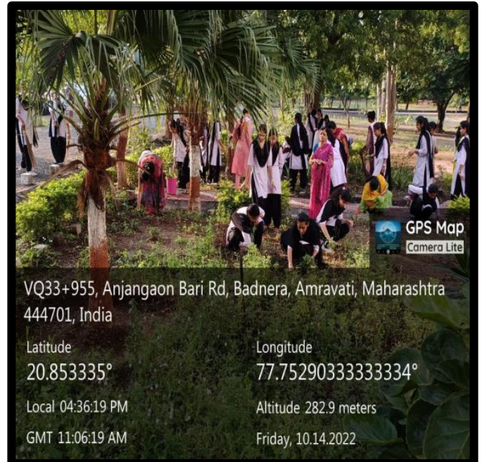
Cleanliness Drive on the occasion of Rashtra Sant Tukdoji Maharaj Death Anniversary on 14.10.2022.