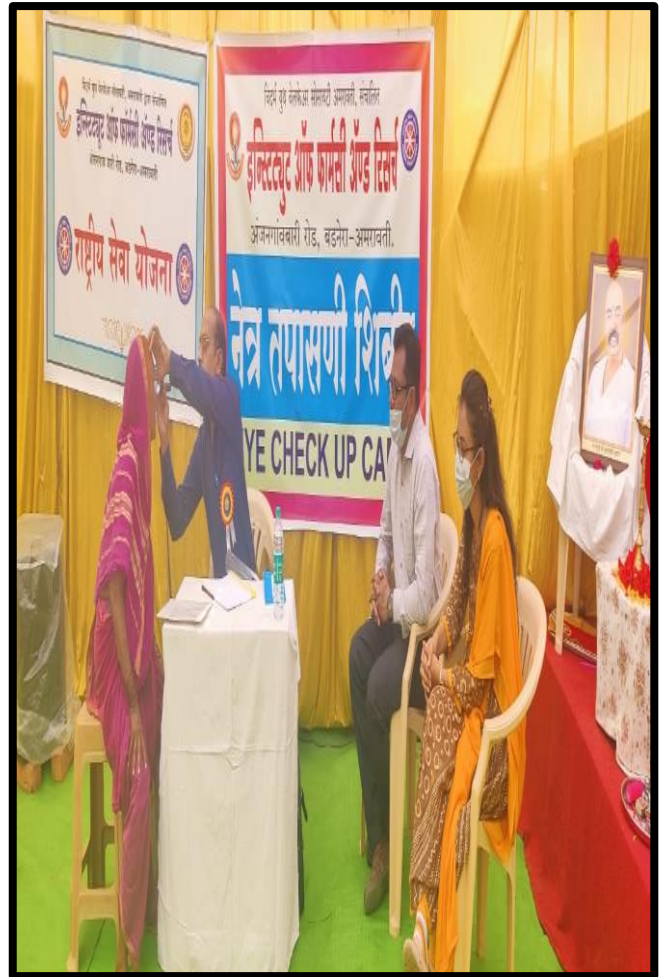
Eye checkup Social Activity Organized in the N.S.S Camp on 10.03.2022 at Sarsi Village.